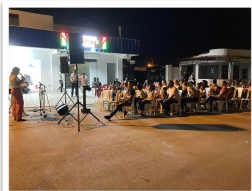
SERVICES TO REACH THE YOUTH IN MANY