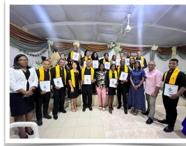
PASTORAL TRAINING FOR REMOTE AREAS