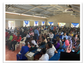
FIRE IN MY BONES CONFERENCES IN MULTIPLE LOCATIONS