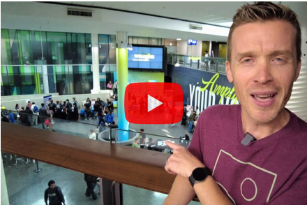
Welcoming students, answering questions, distributing Bibles... please click here and sign up to get access to videos like this!

In our last edition, I highlighted a growing trend some of my campus ministry colleagues and I are seeing: an increased openness and interest in Christianity among those we’re trying to reach (also reported by media outlets like CTV and other national ministry leaders). The stories are encouraging, but the question foremost in my own mind has to do with why / what’s driving this? Well, here’s some of what I’ve learned through my own conversations with newcomers this fall.